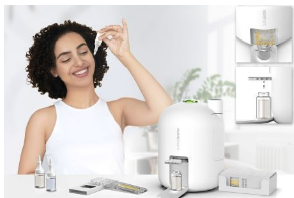
COSMECHIP WON A CES INNOVATION AWARD IN THE HOME APPLIANCE CATEGORY.

Amorepacific Inc. celebrates its fourth year winning a CES 2023 Innovation Award, reserved for products that are new to the market or projected to be available between 1 April 2022 and 1 April 2023. The Seoul-based firm's Authentic Color Master by Tonework customized skin care technology took honors in the cosmetics category. The smart manufacturing system precisely analyzes the facial skin tone using algorithms and, with robotics, tailor-makes liquid cushion foundations as well as lip products, according to the company. "The device provides customized color recommendations based on facial recognition technology and color science research," the firm says. Amorepacific also received an award in the Home Appliance category for its Cosmechip, a device that employs microfluidic channel technology to create uniformly combined formulations using a small amount of water and active ingredients contained in "chips" to address various skin conditions and preferences. (Also see " AI-Backed Personalization Could 'Transform' Consumer Product Advertising, Sales By 2030 " - HBW Insight, 5 Oct, 2021.)