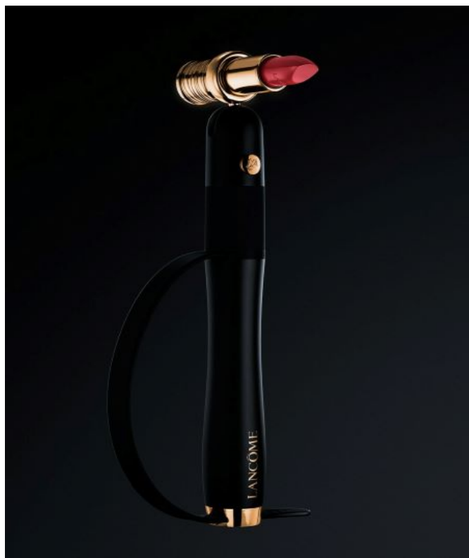
L'OREAL'S HAPTA COMPUTERIZED MAKEUP APPLICATOR

through the brows and move the printer across the eyebrow in a single, sweeping motion, before applying a topcoat finish to lock in the look. Brow Magic, which can be easily removed with a standard makeup remover, will launch in 2023.